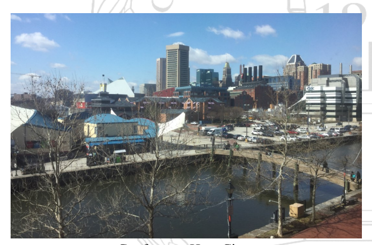
Conference Host City Baltimore, MD