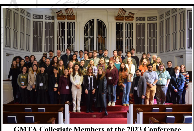
GMTA Collegiate Members at the 2023 Conference

In closing, I am immensely proud of the achievements and progress of our Collegiate Chapters. Together, we are making a substantial impact on the musical landscape of our state, nurturing the next generation of music educators and performers.